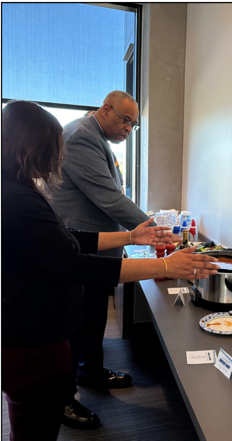
OLYMPIA, Wash. - The Washington State Patrol's Office of Culture and Engagement (OCE) hosted a Taste of the WSP event encouraging folks to bring different dishes that represented their culture. The event was timed with SAF, providing the opportunity for folks across the state to participate.