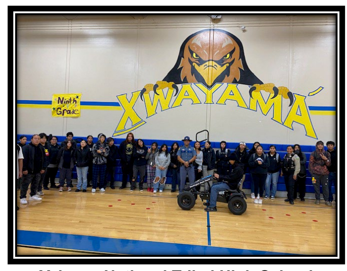
Yakama National Tribal High School