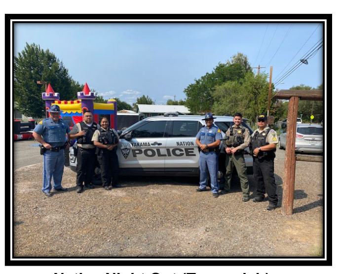
Native Night Out (Toppenish)