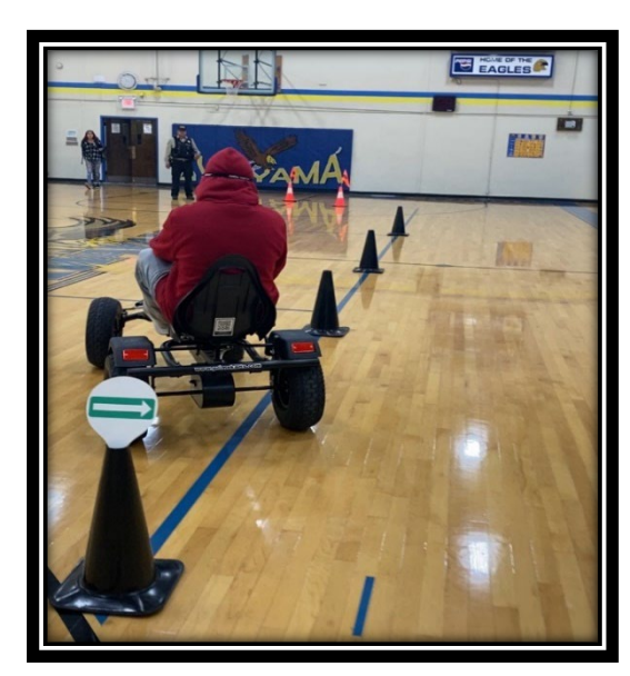
White Swan High School / Pedal Kart Course