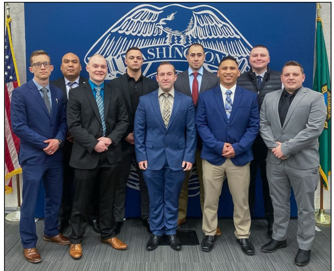
OLYMPIA, Wash. - This week we welcomed the members of the Washington State Patrol (WSP)'s first ever lateral class. These officers are beginning training to soon become troopers. Their compressed training course will take place over the next three months. We welcome them to the agency, and are looking forward to seeing their historical journey unfold within our agency.