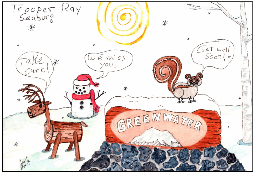
GREENWATER, Wash. - Folks from the community of Greenwater made cards for our WSP trooper who was seriously injured during a shooting in Kent last month. We appreciate the community's outpouring of care and support as our trooper continues to heal.