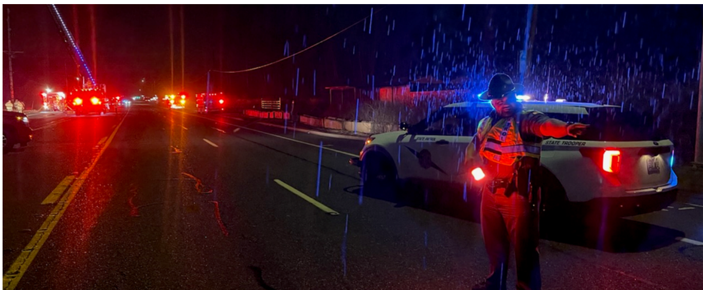
STATEWIDE - The 118th Trooper Basic Training Class (TBTC) cadets have been on their coaching trip for more than a month now. They've been able to put what they learned in the classroom to practice, including removing impaired drivers from our roadways, responding to and investigating collisions, and assisting motorists along our roadways.

Alongside each cadet is a Field Training Officer (FTO) who provides guidance and further on-the-job training, familiarizing the trooper cadet with departmental forms and the detachment's geographical area of coverage. They learn about traffic patterns, common collision areas, and assess the cadet's performance with daily observation reports. There are more than seven weeks before they're sworn in as troopers during their graduation ceremony. After graduation, they'll report to their assigned districts and begin a year-long probationary period.