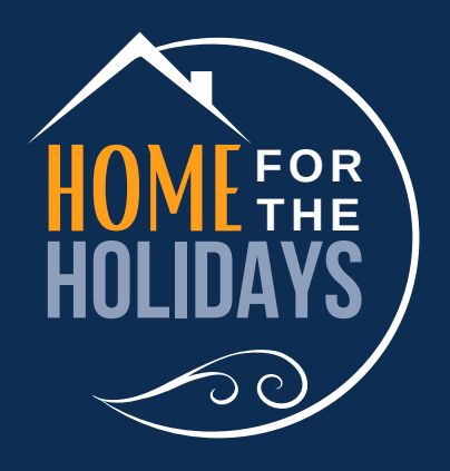
talented 5th graders, so let's win this contest! Learn more on the WSP InsideOut Blog.

FINAL 2023 EDITION- This is the final edition of the first volume of The Milepost. We will begin the second volume in 2024! Thank you all for reading, as well as providing content to share across the agency. The true purpose of this publication is to showcase the amazing work from each of you across our vast agency. We look forward to seeing what 2024 brings! Be safe!