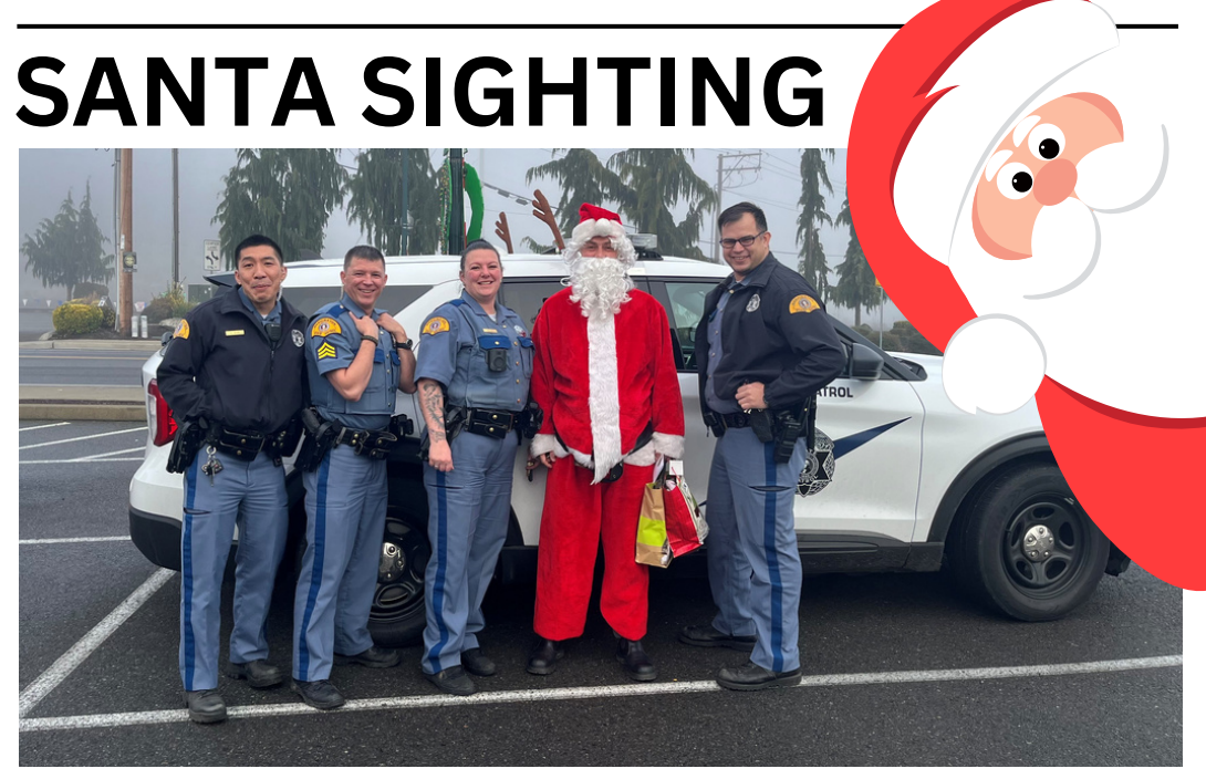
TACOMA, Wash. - Santa was preparing for the upcoming weekend when he came across a detachment of District 1 Eastside troopers. He was more than willing to take a photo before getting back to his second check of the naughty and nice list.

STATEWIDE - Washington State Patrol (WSP) troopers are working alongside law enforcement agencies across the state during Target Zero's Night of 1,000 Stars event. The night, specific to each county, focuses the efforts of troopers, officers, and deputies within a specific area to intercept impaired drivers before they cause a collision that could cost a life. The events are kicked off with a briefing that often is attended by the family members of an individual who was killed in an impaired driving collision. Thank you to all the troopers who have participated in these events across the state this month. In District 5, participating agencies were able to remove 10 impaired drivers from their roadways - seven of which were processed utilizing the agency's Mobile Impairment Driving Unit. In District 8, Bremerton area patrols conducted 65 traffic stops resulting in the removal of six impaired drivers from the roadways. See more iimages from the events on page two.