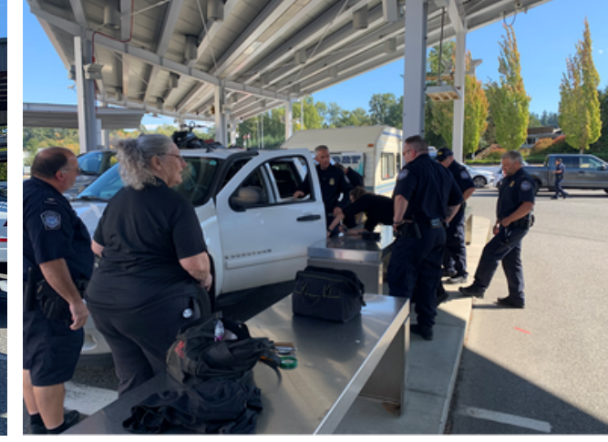
BLAINE, Wash. - Washington State Patrol (WSP) VIN inspectors and members of the Commercial Vehicle Enforcement Bureau (CVEB) partnered to provide a joint two-day training to the Customs and Border Protection last month. The 40-person class learned specifics on VIN, including how to identify counterfeits, cloning, and commercial vehicle VIN issues.