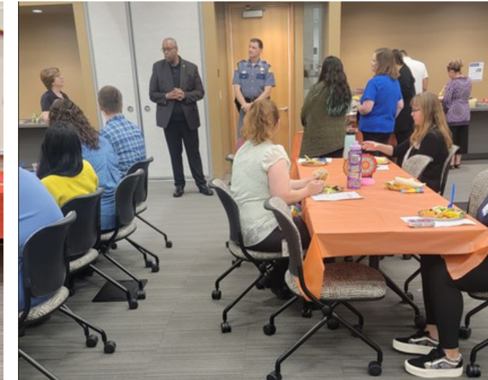
OLYMPIA, Wash. - The Washington State Patrol (WSP) Firearms Background Division hosted their first teambuilding celebration last month. The team was happy to have Chief Batiste stop by and speak with the staff, which included its 21 new staff members.