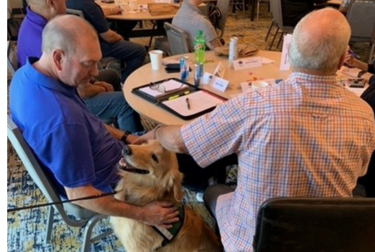
ELLENSBURG, Wash. - The Washington State Patrol's Criminal Investigation Division (CID) VIN program had their annual in-service in Ellensburg, which included a visit from the HOPE dogs.