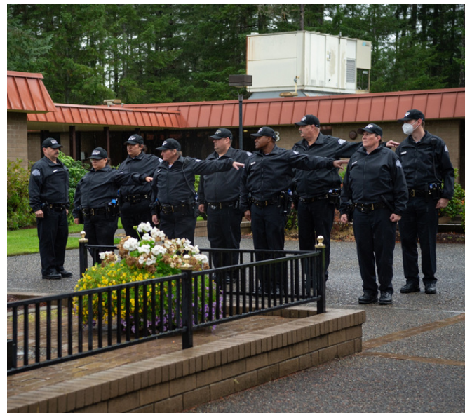
SHELTON, Wash. - The Washington State Patrol (WSP) academy continues to be busy as the cadets of the 119th Trooper Basic Training Class (TBTC) and recruits of the 19th Commercial Vehicle Enforcement Officer (CVEO) Basic class train. From the drive course to the classroom, firing range to controlled tactics in the gym, the cadets and recruits are working hard toward their goal to one day soon graduate and help serve communities across the state.