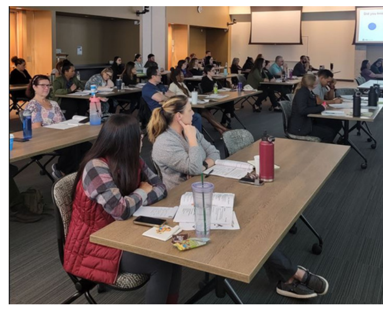
STATEWIDE - FBI trainers traveled cross Washington State throughout late September providing firearm background check training to the Washington State Patrol (WSP) Firearms Background Division staff. A total of 140 people attended the course, with classes given across the state in Snohomish County, Olympia, Federal Way, Yakima, and Spokane.