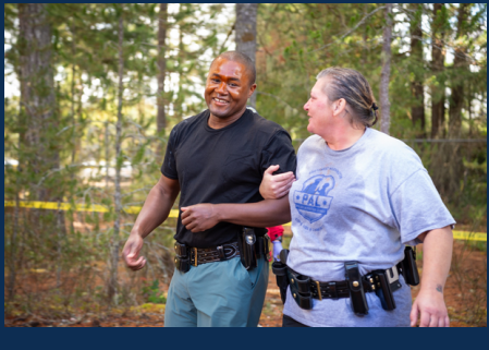
SHELTON, Wash.- See what the cadets and recruits have been up to as they continue their training to soon serve the communities across our state.