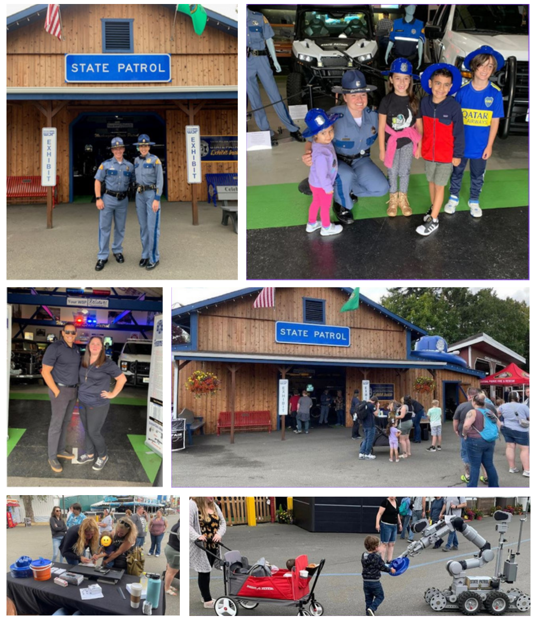
PUYALLUP, Wash. - The Washington State Fair is open now through Sept. 24 in Puyallup, Wash. Thank you to all those across the agency who have staffed the WSP exhibit. Feel free to send photos of you and your teams at the fair to pio@wsp.wa.gov to be featured in future editions of The Milepost .