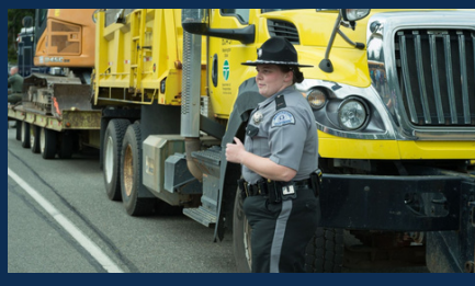
SHELTON, Wash. - The 2023 Legislative Tour late August showcased all the agency's different divisions. Check out photos from the event in an upcoming issue of The Milepost .