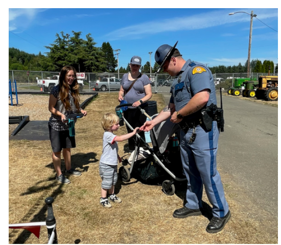
STATEWIDE - WSP personnel are participating in county fairs throughout the state! District 8 and District 5 have been a part of the Grays Harbor County Fair and Clark County Fair (respectively thus far) with several other fairs slated to begin throughout the rest of the summer. See more of our agency's involvement in future editions.