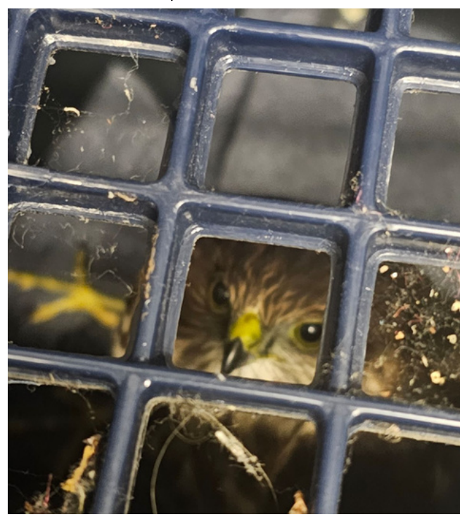
SHELTON, Wash. - A sharp-shinned hawk was found inside the Washington State Patrol (WSP) Academy gym in Shelton a few weeks ago. The injured bird was taken to a local raptor center, where it has since healed and was successfully released back on the campus. Great job to the academy staff for successfully finding the hawk and getting it the help necessary to fly another day!