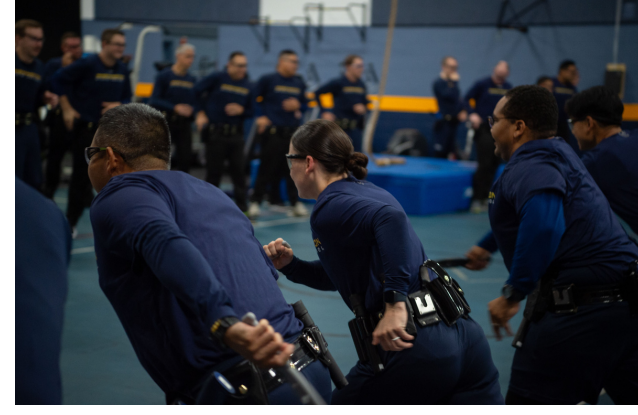
SHELTON, Wash. - The cadets of our 118th Trooper Basic Training Class (TBTC) had another busy week filled with report writing and hazmat instruction - as well as gas mask fittings and exposure to CS gas.

Additionally, our cadets were introduced to edge weapon familiarization and defense tactics. These skills help keep the cadets safe if they encounter such incidents while working the roads as a fully commissioned trooper.