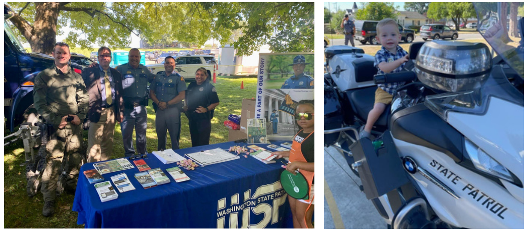
STATEWIDE - National Night Out (NNO) events took place across the state on Aug. 1, 2023. The event provided troopers the opportunity to spend quality time with members of the communities they serve. Check out more photos on page three and four.