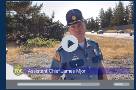
SURVIVING SUMMER - Assistant Chief Mjor shares a public safety message in light of the alarming number of fatalities that occurred during the past weekend.