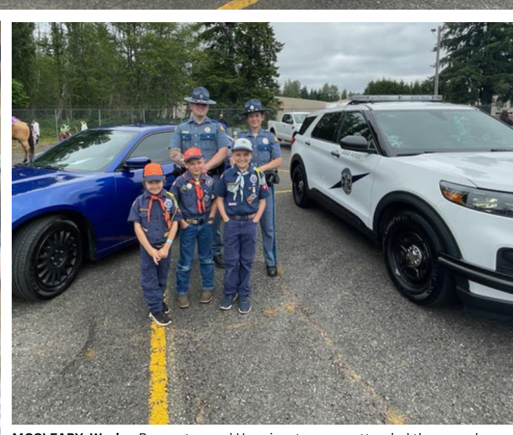
MCCLEARY, Wash. - Bremerton and Hoquiam troopers attended the annual McCleary Bear Festival earlier this month. There was also a special guest appearance by WSP Mascot Trooper Ted. E. Bear. In addition to participating in the event's parade, the troopers also passed out junior trooper stickers and spent time with the 2,000 folks in attendance.