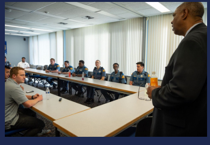
DISTRICT TOURS - The Chief continues to tour the districts across the state. Check out next week's edition for images from his visit to District 5.