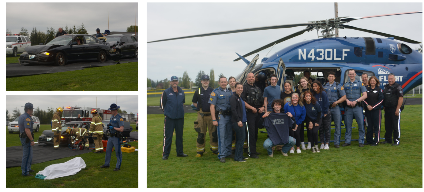
BELLINGHAM, Wash. - District 7 troopers joined allied agencies at the Meridian High School's Mock DUI collision event Thursday. The event is intended to be for educational purposes, showing the real consequences related to impaired or distracted driving. The event was part of a senior project.