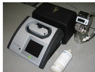
Draeger 9510 Breathalyzer Instrument