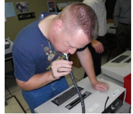
BAC Recertification Student